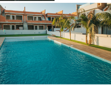
Modern New Build Apartments Pilar de la Horadada

Modern New Build Apartments Pilar de la Horadada *JUST ONE APARTMENT LEFT AVAILABLE* *ASK US ABOUT THE PARAMOUNT NEW BUILD DEAL* *FURNITURE INCLUDED* This is an exclusive residential of 26 modern apartments using top-quality materials, and offering a choice of either 2 bedroom or 3 bedroom properties on the ground floor or top floor, which include a great private terrace or solarium. Both choices have spacious terraces and private parking. This residential complex also offers a landscaped common area with swimming pool, where you can enjoy the sunshine all year round. Located in Pilar de la Horadada, a privileged environment, just 15 minutes by bike from the beaches of Torre de la Horadada and the beaches of San Pedro del Pinatar and a few steps from the town center and shopping centers.